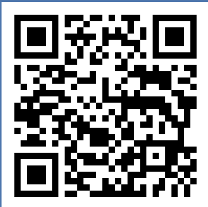
Erping Shan Campus